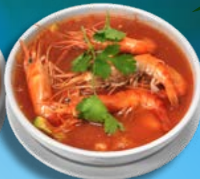
Caldo de Langostinos 22 99 Prawns soup