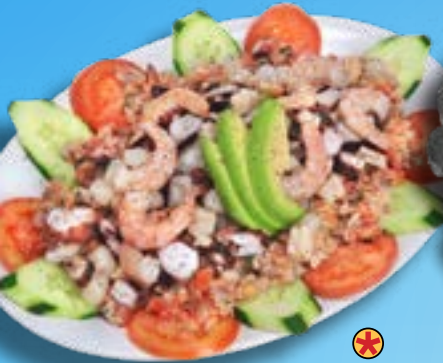
Botana Fria de Mariscos Sm 25 99 Lg 45 99 Seafood mix appetizer (Served cold): shrimp, octopus and fish ceviche