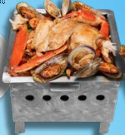
Parrillada de Mariscos 55 99 Seafood platter: mussels, crab legs, clams, fish fillet, octopus and shrimp