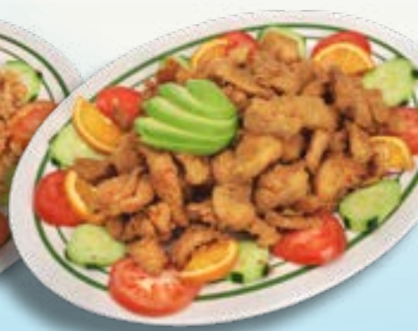
Chicharrón de Pescado Sm 20 99 Lg 30 99 Deep fried battered fish strips