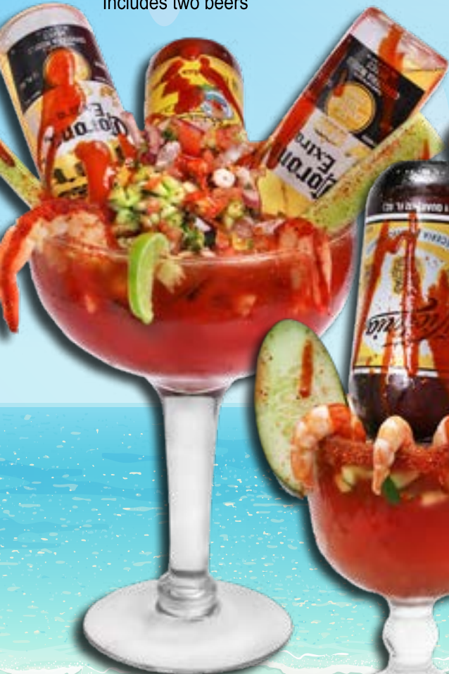
Tres Palmas 25 95