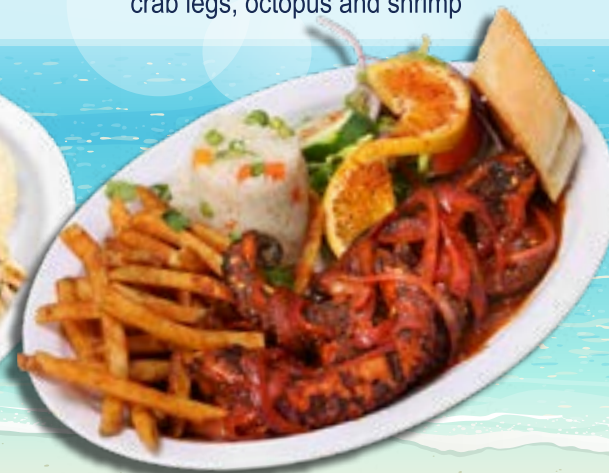
Pulpo Entero Al Gusto 24 99 Whole octopus to your liking • GARLIC • SPICY DIABLA SAUCE • NAYARIT or A LA PLANCHA