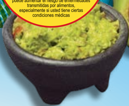
Guacamole MP$ Sm & Lg

Los artículos marcados con un asterisco (*) se sirven crudos, poco cocidos o son cocinados a pedido del cliente. El consumo de alimentos crudos o poco cocidos como carne, aves, mariscos o huevos puede aumentar el riesgo de enfermedades transmitidas por alimentos, especialmente si usted tiene ciertas condiciones médicas