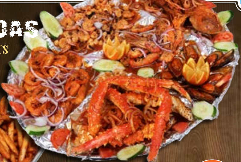
Mariscada Océano MP$ Includes: Chapuzón (octopus and shirimp) • Shrimp cucaracha style (In spicy Huichol sauce), prawns, mussels and crab legs Nayarit style. and one whole red snapper