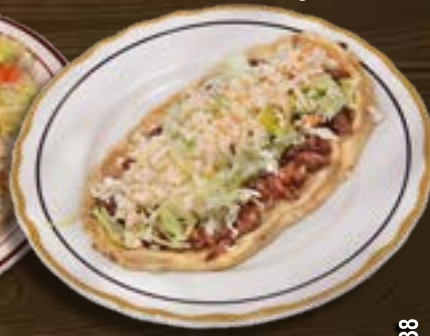
HUARACHES 9 99 Your choice of steak, chicken or pastor (marinated pork)