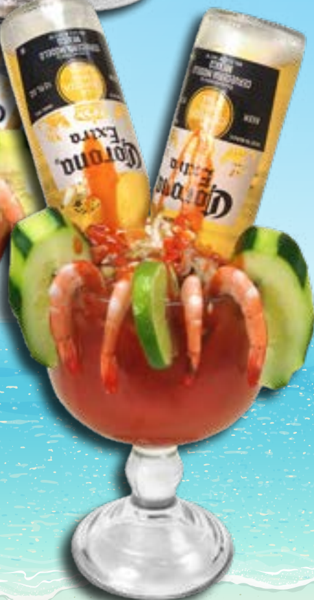
Las Cuatas 18 95