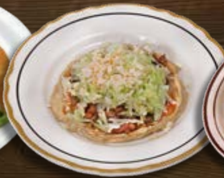
SOPES 7 99 Your choice of steak, chicken or pastor (marinated pork)