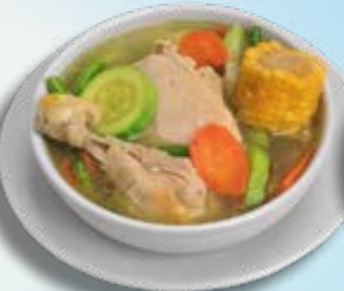
Caldo de Pollo 18 99 Chicken soup with vegetables. Your choice of red or white