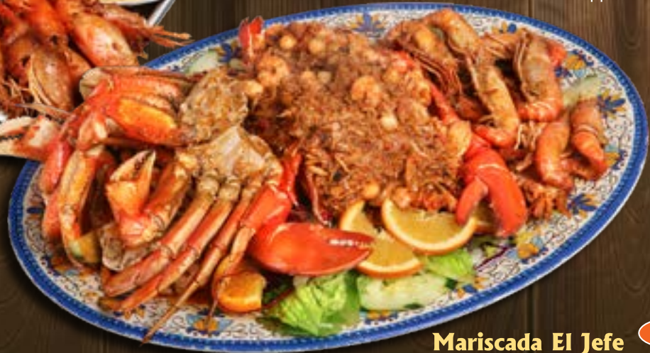
Mariscada El Jefe MP$ Includes: Crab legs, prawns and one lobster stuffed with seafood mix. All Nayarit style