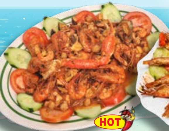
Levantamuertos Sm 33 99 Lg 62 99 Mixed seafood in our special Nayarit sauce: shrimp, octopus, scallops and crab legs