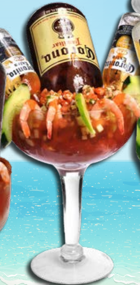
Pancho Villa 29 95