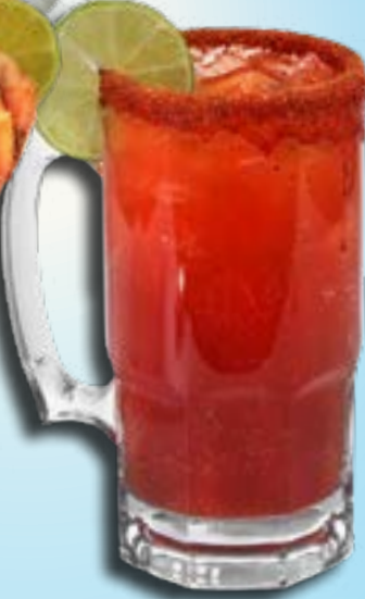
Michelada Regular 10 95