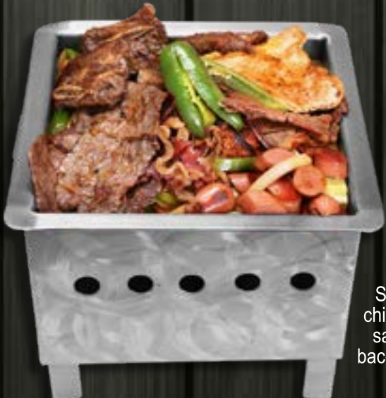
✦ Parrillada de Carnes 49 99 Serves 2 people: Skirt steak, cured steak, chicken, Mexican sausage, sausage, beef short ribs, bacon, onion, green peppers & a grilled jalapeño