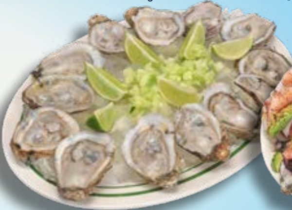
Ostiones en su Concha Raw oysters (6) 12 99 (12) 22 99