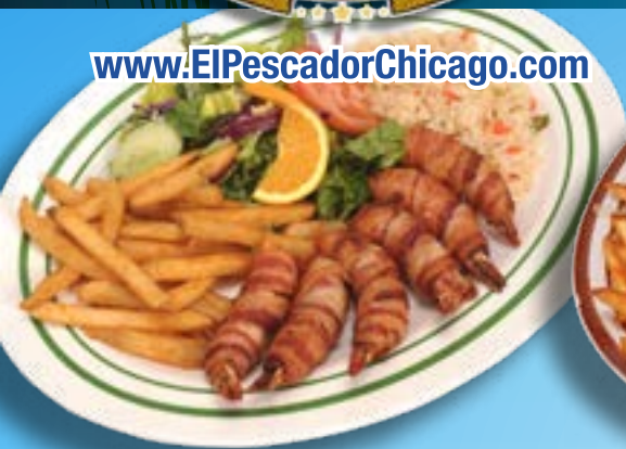
Camarones Momia 20 99 Shrimp wrapped with cheese and bacon