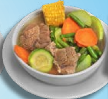
Caldo de Res 19 99 Beef soup with vegetables. Your choice of red or white