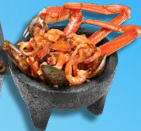
Molcajete de Mariscos 38 99 Seafood mix: shrimp, octopus, mussels and crab legs in our Nayarit sauce

CONSUMER ADVISORY Items marked with an asterisk (*) are served raw, undercooked or cooked to order. Consuming raw or undercooked meat, poultry, seafood, shellfish, or eggs may increase your risk of foodborne illness, especially if you have certain medical conditions AVISO AL CONSUMIDOR Los artículos marcados con un asterisco (*) se sirven crudos, poco cocidos o son cocinados a pedido del cliente. El consumo de alimentos crudos o poco cocidos como carne, aves, mariscos o huevos puede aumentar el riesgo de enfermedades transmitidas por alimentos, especialmente si usted tiene ciertas condiciones médicas