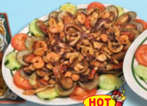
Mejillones Especiales 48 99 Mussels topped with a seafood mix: shrimp and octopus in Nayarit sauce