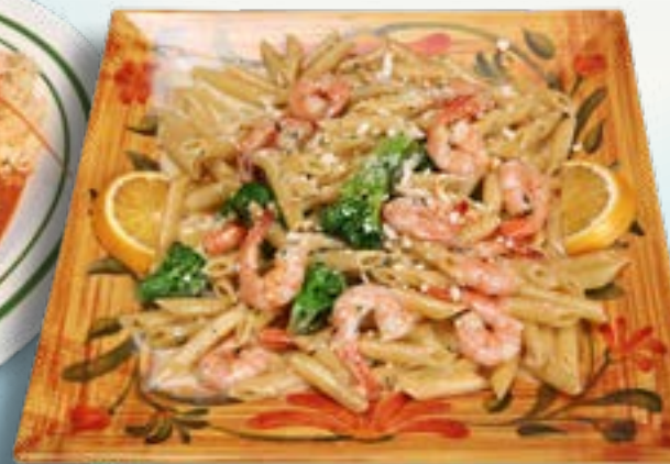
Pasta Con Camarones 21 99 Pasta with shrimp and broccoli