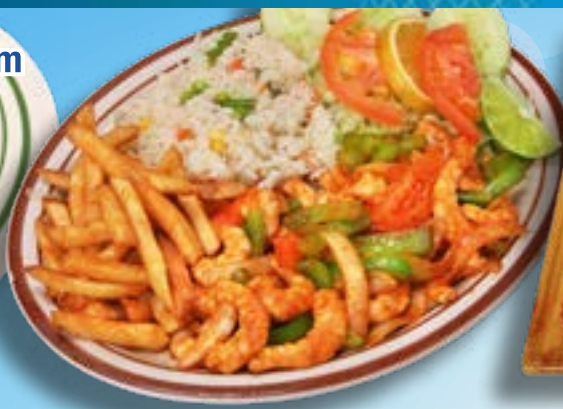
FAJITAS DEL MAR Camarón Shrimp 21 99 (Pictured) Mix Shrimp, chicken & steak 21 99