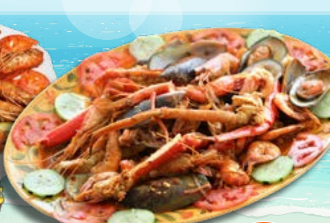
Charola Pescador 85 99 Shrimp, mussels, prawns and crab legs