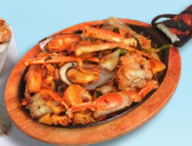
Mini-Parrillada de Mariscos 25 99 Seafood mix skillet: mussels, crab legs, octopus and shrimp