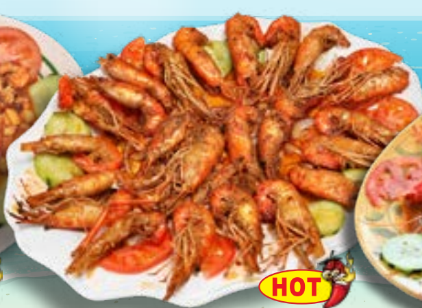
Langostinos Sm 32 99 Lg 52 99 Prawns sauteed in Nayarit sauce