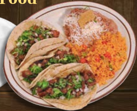
TACOS Each 4 50 Dinner (3) 15 99 Asada Steak Pollo Chicken Pastor Marinated pork Cecina Cured steak Chorizo Mexican sausage