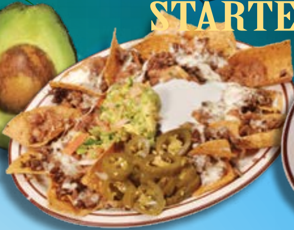
Nachos Reg 10 99 With Steak 12 99