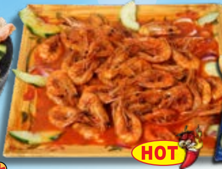
Camarones Cucaracha 29 99 Fried crunchy shrimp in Huichol sauce