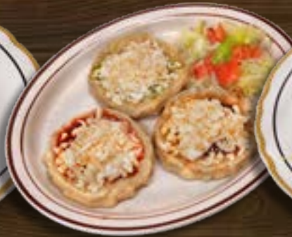
PICADITAS ESTILO GUERRERO (3) 11 99 Servidas con salsa de molcajete