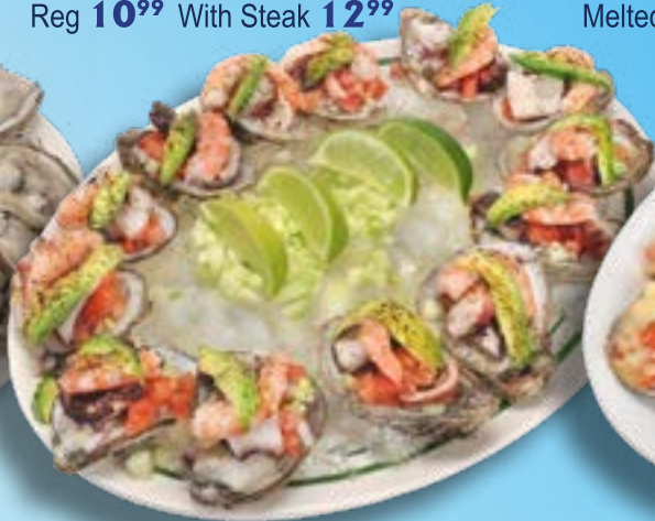
Ostiones Preparados Raw oysters with octopus & shrimp (6) 16 99 (12) 28 99