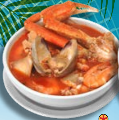
Caldo Siete Mares 23 99 Seafood mix soup: shrimp, octopus, crab leg, clams, scallops