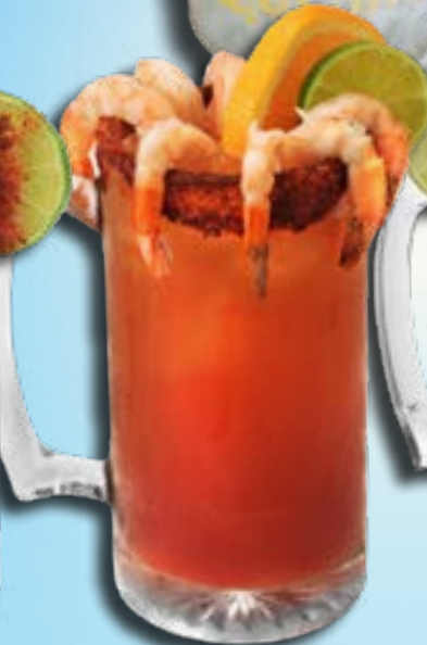
Michelada Del Mar 15 99