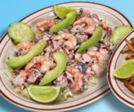
Pulpo Enamorado 21 99 Octopus and shrimp in our delicious mayo sauce