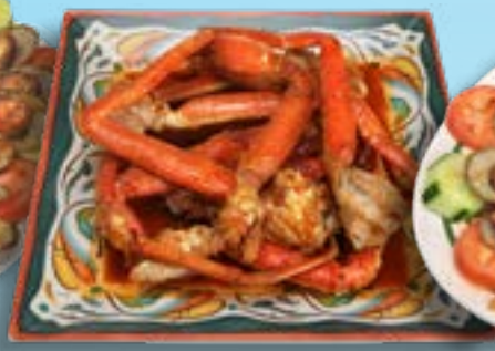
Patas de Cangrejo MP$ Crab legs in Nayarit sauce