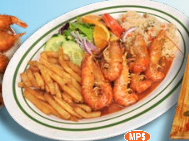
Platillo de Langostinos Nayarit 24 99 Prawns Nayarit style