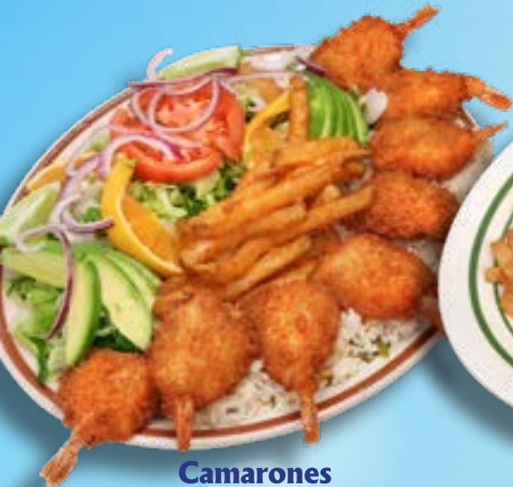
Camarones Empanizados 20 99 Breaded shrimps