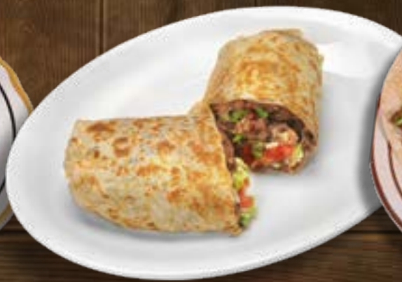
Burritos 10 99 DINNER 14 99 Your choice of steak, chicken or pastor (marinated pork) All served with beans, lettuce, tomato, sour cream & cheese