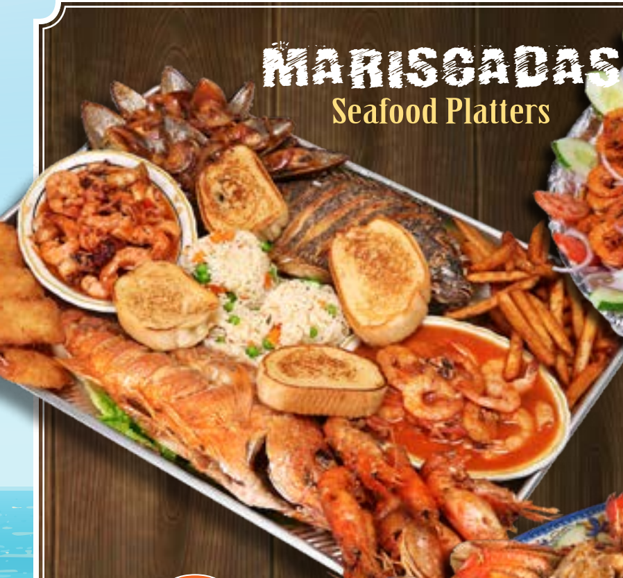
MP$ Mariscada Playa Bonita Includes: Chapuzón (octopus and shirimp, whole tilapia, whole red snapper, shrimp in spicy diablo sauce, prawns Nayarit style, mussels Nayarit, breaded shrimp, rice and fries