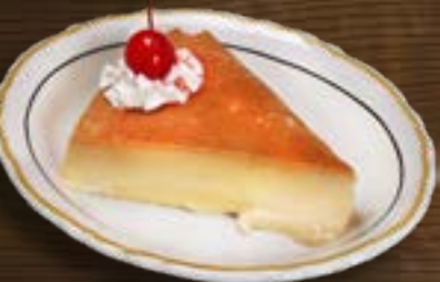
Flan de Queso 5 99 Cheese custard