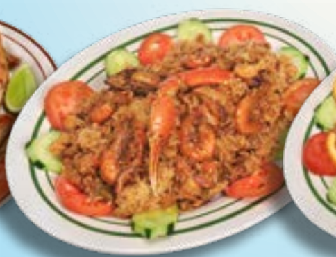
Paella del Mar Sm 22 99 Lg 35 99 Rice with seafood mix: shrimp, mussels, octopus and a crab leg