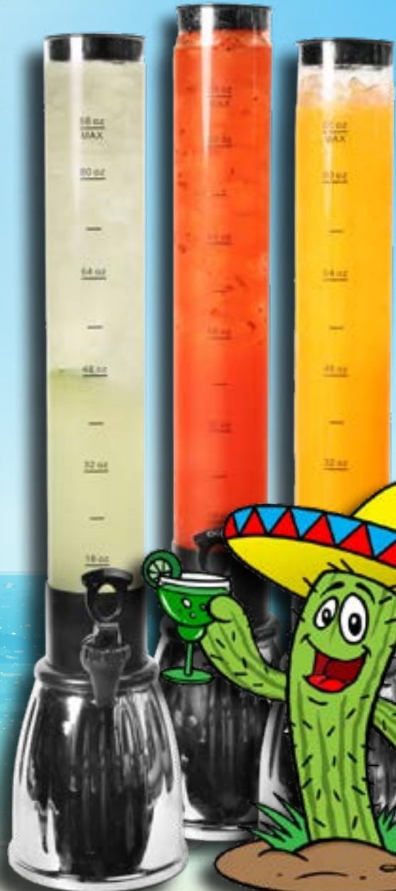
Sangria Margarita 15 99 House tequila, margarita mix, lime juice, red wine and chopped fruit