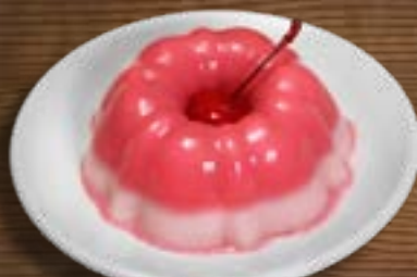
Gelatinas 3 99 Jello