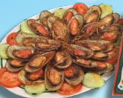
Mejillones Nayarit Sm 19 99 Lg 33 99 Mussels in Nayarit sauce