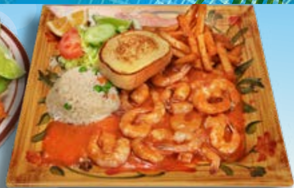
Camarones al Gusto 20 99 Shrimp to your liking: • ON THE GRIDDLE • GARLIC SAUCE • DIABLA SAUCE (Pictured)