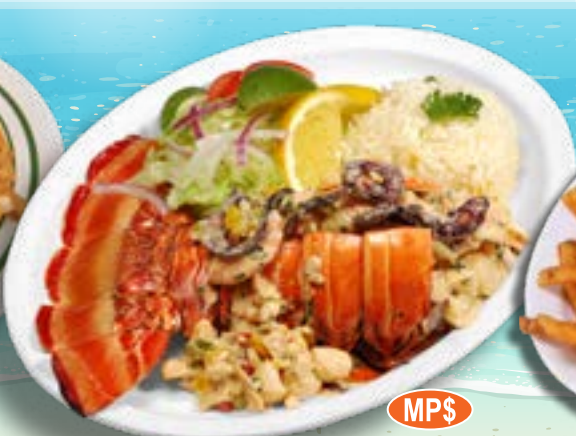
Langosta Rellena Lobster tail with seafood mix: shrimp and octopus and our creamy mushroom sauce