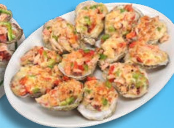
Ostiones Gratinados Baked oysters with shrimp & cheese (6) 16 99 (12) 28 99