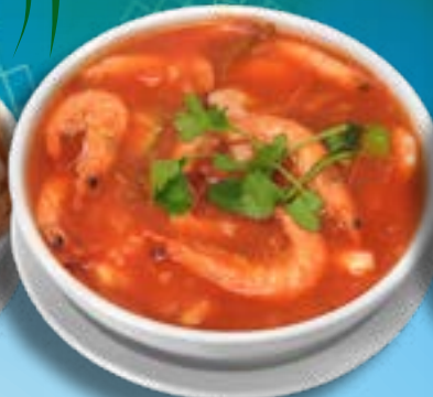
Caldo de Camarón 19 99 Shrimp soup: Shell-on or peeled