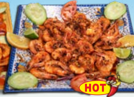
Camarones Coras 29 99 Hot crunchy shrimp with chile de arbol