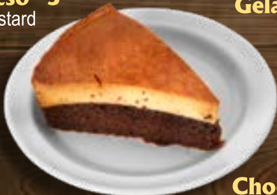
Chocoflan 5 99 Chocolate cake- custard