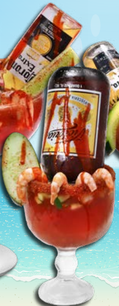
Bombazo! 19 95