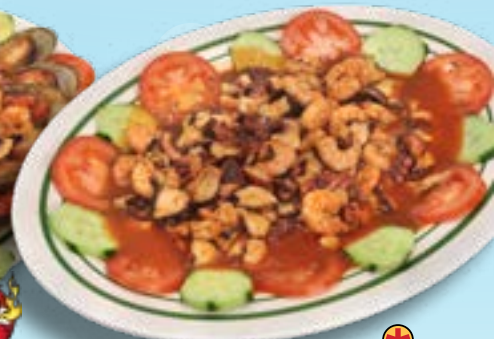
Chapuzón del Mar Sm 32 99 Lg 53 99 Seafood mix: shrimp, octopus and oysters in Nayarit sauce