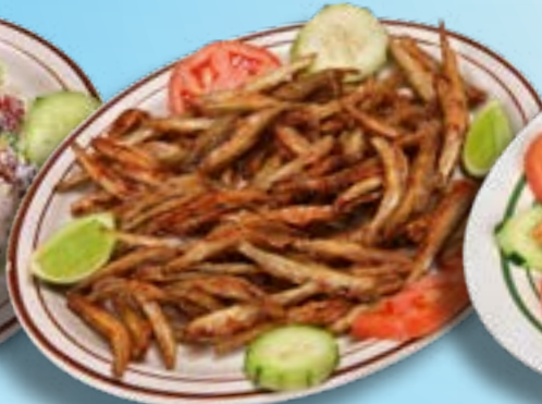
Charales Fritos 21 99 Fried smelts