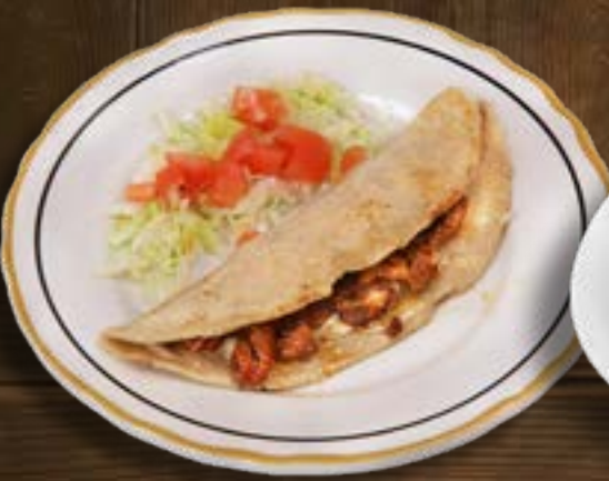
QUESADILLAS 8 99 Your choice of steak, chicken or pastor (marinated pork)