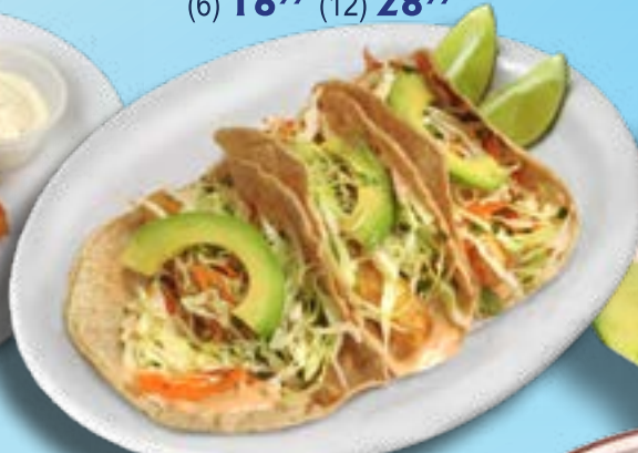
Tacos de Camarón o Pescado Shrimp Taco 5 99 Fish Taco 5 99