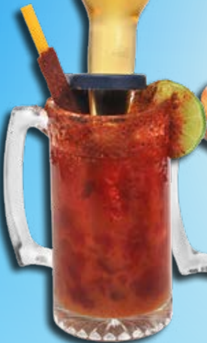
Michelada Doble 14 95 Includes two beers