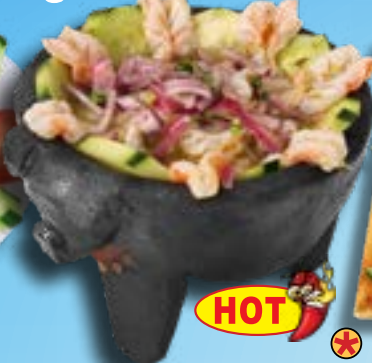
Camarones Aguachile 23 99 Raw shrimp marinated in fresh lime juice and HOT green salsa