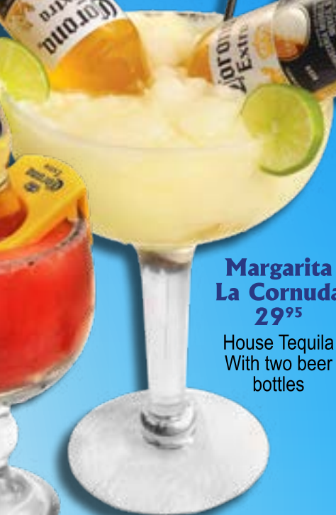
Margarita La Cornuda 29 95 House Tequila With two beer bottles