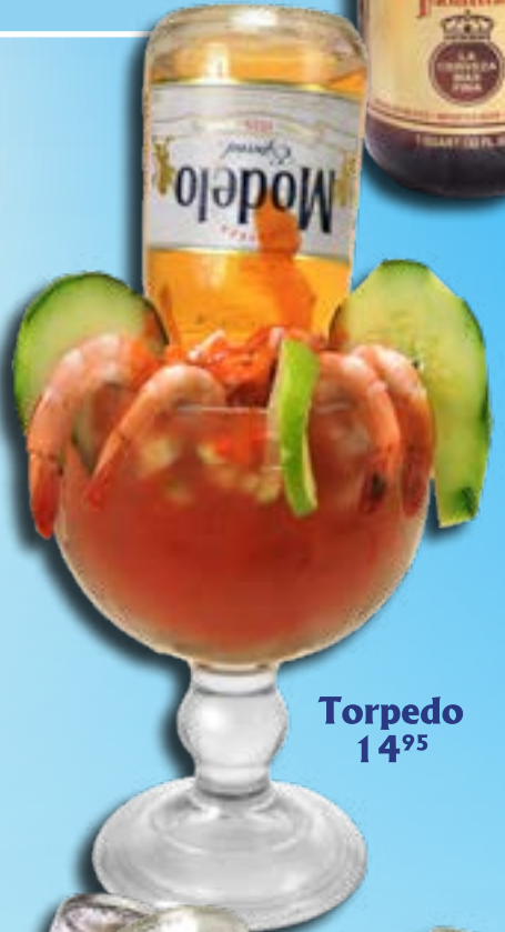
Torpedo 14 95