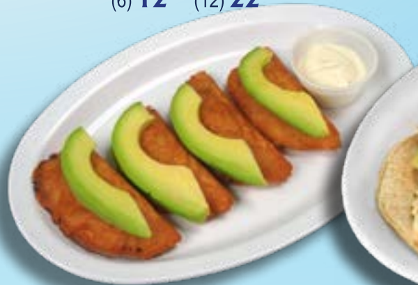
Empanadas de Camarón Shrimp & cheese empanadas (4) 11 99 (8) 20 99