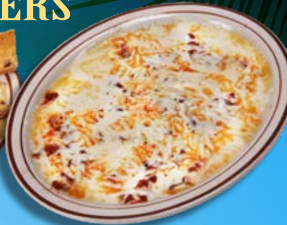
Queso Fundido Con Chorizo Melted cheese with Mexican sausage 11 99